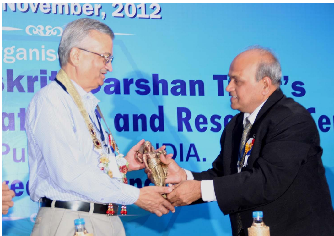
Visit and Guidance of Respected Padma Vibhushan Dr Anil Kakodkar Sir to Integrated Cancer Treatment and Research Centre, 2012