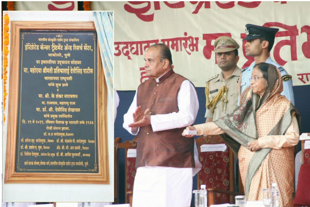
Inauguration of Integrated Cancer Treatment and Research Center by Honorable President of India, Smt. Pratibha Devisinha Patil , 2011