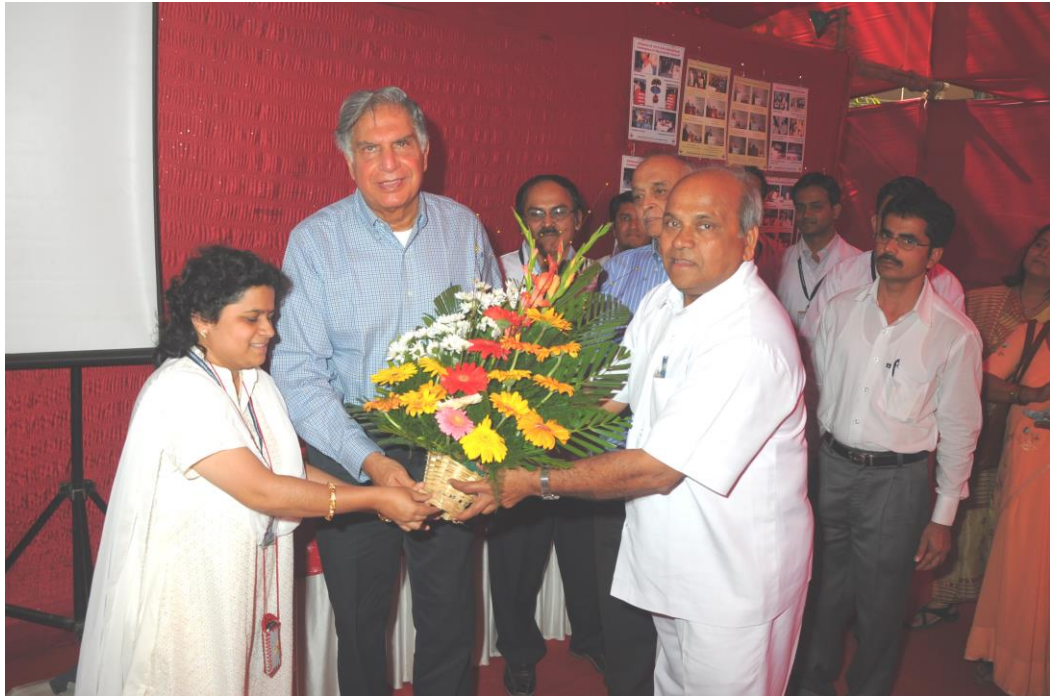
Visit and Guidance of Respected Padma Vibhushan Mr. Ratan Tata to Integrated Cancer Treatment and Research Centre, 2011